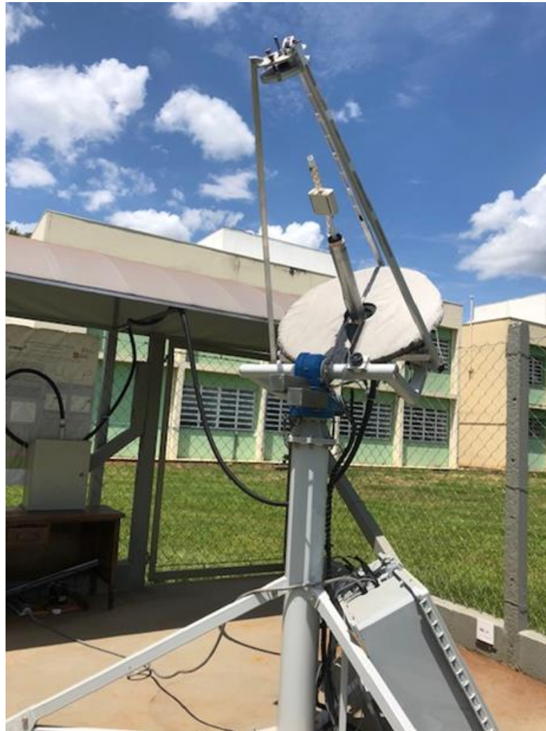
Figure xx. A prototype of energy concentrator coupled to optical fibers installed in the IQ-UNESP, Araraquara, SP.

shortly. The name of the project is "Energy concentrator coupled to optical fibers." Its function is to concentrate more efficiently the solar energy using mirrors coupled to an optical system (fiber optics) and to transport it to specific places. The system is flexible in responding to different purposes, for example, 1) disinfection of water by photocatalysis (original); 2) disinfection of animal manure; 3) drying of minerals; 4) lighting of large buildings; 5) heating water for the destruction of copper cyanide; (remediation); 6) machining of materials (3D manufacturing, cutting, etc.) (glass melting); 7) Desalination of seawater. The picture below (Figure xx) shows the prototype installed in the IQ-UNESP, Araraquara, SP.